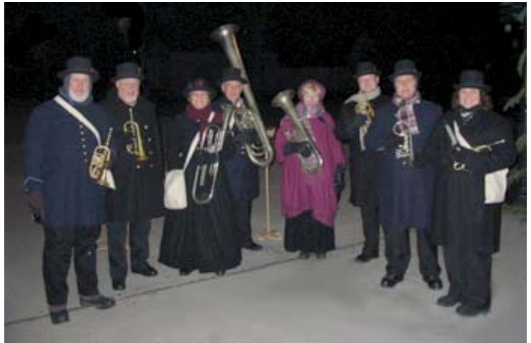
DSB in “Holiday Nights” at The Henry Ford

“What if it’s cold outside?”, say you. “The show must go on!”, say I! Yes, it often gets a bit nippy out in the village, but there are camp fires on most street corners and there are many shops which offer warmth as well as a “step back in time”. The band provides several audience interactive shows during the evening. Singing, playing, and enjoying the night are standard fare for the “Holiday Nights”. You are not only invited, but encouraged, to come to The Henry Ford, in Dearborn and join in the festivities of the “Holiday Nights”.